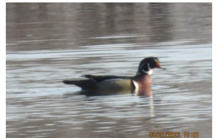
Spring Migration

Thanks to all our advertisers! Please visit their businesses and thank them for their support of Loon Lake!