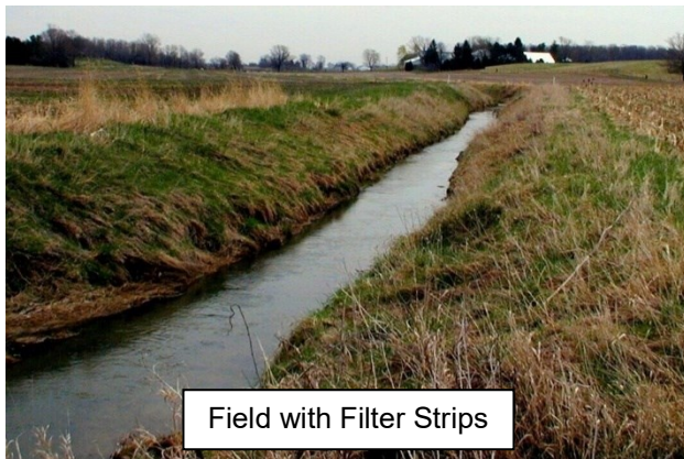
Field with Filter Strips

Grants, cost sharing and technical assistance have positively affected farmers' engagement in watershed management. There are several other actions that have improved farmer involvement. One activity is an increase in outreach to farmers by watershed management organizations. This outreach creates a greater awareness regarding improvement of soil and water conservation and the positive effects that are a result.