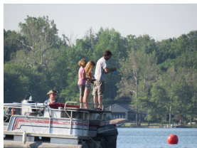
Is it easier to fish from up high?

Mark your calendars - Saturday, June 4, 2022!!