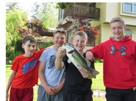
Great way to spend a day!