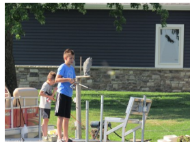
I hope there is a fish here!