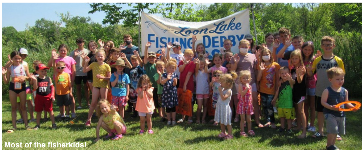
Most of the fisherkids!

Let's start at the Spring membership meeting - the 'fish' bucket was passed and the members in attendance came through again. The bucket was full for us to purchase prizes and medals for the 2021 LLPOA Kid's Fishing Derby - THANK YOU! The volunteer sign-up sheet had several names on it and all of the help was appreciated - THANK YOU!