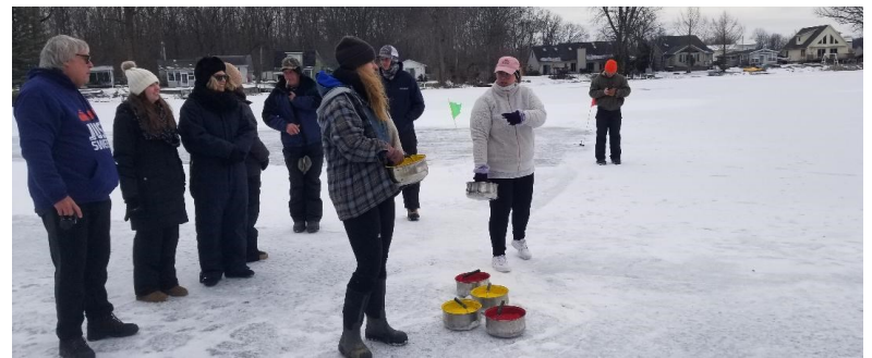
Fun any season on Loon Lake. Curling, ice skating and golf on the ice.