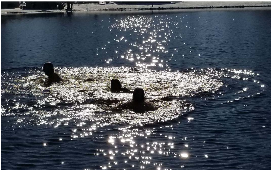
Warm Winter Greetings! A few Loonies did their long standing tradition of taking a New Year Day plunge! Hearty stock (or crazy) here on Loon Lake!